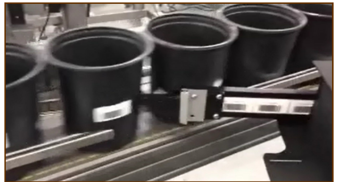
Reliable wipe-on strip edge label application